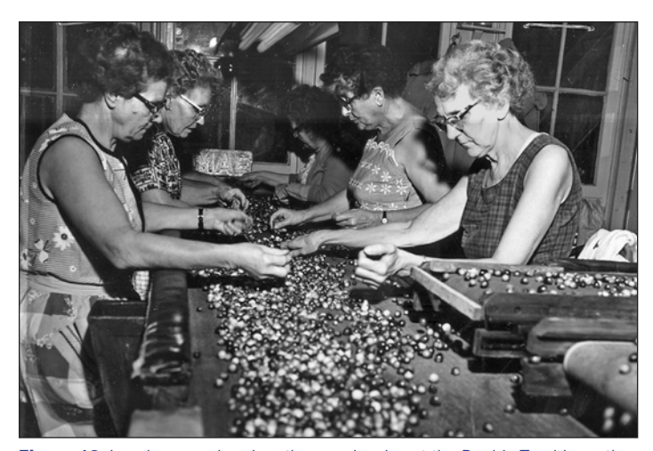
Figure 10. Local women hand sorting cranberries at the Double Trouble sorting and packing house.