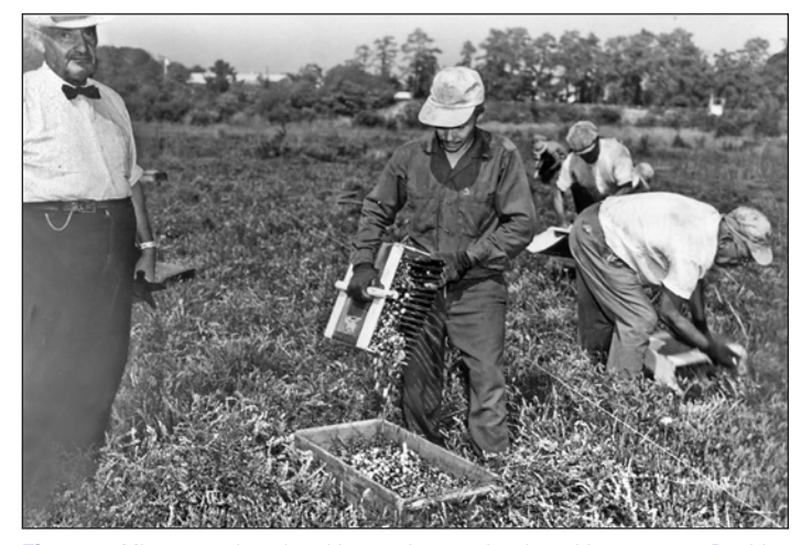
Figure 8. Migrant workers hand harvesting cranberries with a scoop at Double Trouble Village in Ocean County, New Jersey.