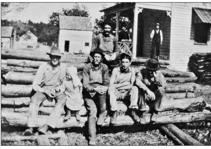
Figure 6. Workers and their families outside the Double Trouble General Store. (Courtesy New Jersey Department of Environmental Protection, Double Trouble Village State Historic Site archives, circa 1910)

MA, about 1816. Farmers soon saw cranberries as a viable commercial crop and started to convert swampland into manmade bog environments.