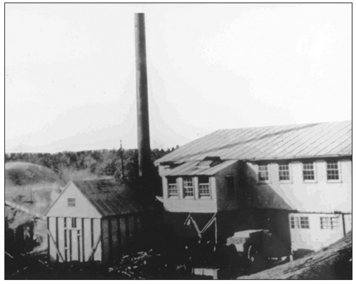
Figure 7. The Double Trouble sawmill was powered by steam in the early 1900s.

For almost a century, cranberries were "dry" harvested at Double Trouble. Berries were originally picked by hand one at a time. As the industry expanded, migrant workers raked berries off the vine with a cranberry scoop—a wooden box with metal tines (figure 8). The fresh cranberries were then sorted and packaged on site for shipment to market (figures 9 and 10). Starting in the mid-1960s the Double Trouble cranberry bogs were "wet" harvested. Bogs were flooded with water from the reservoir. A machine was then used to knock the buoyant berries off the submerged vines. These floating cranberries were corralled to one side of the bog and removed for shipment to a central receiving plant in Chatsworth, NJ (figure 11). As the cranberry industry