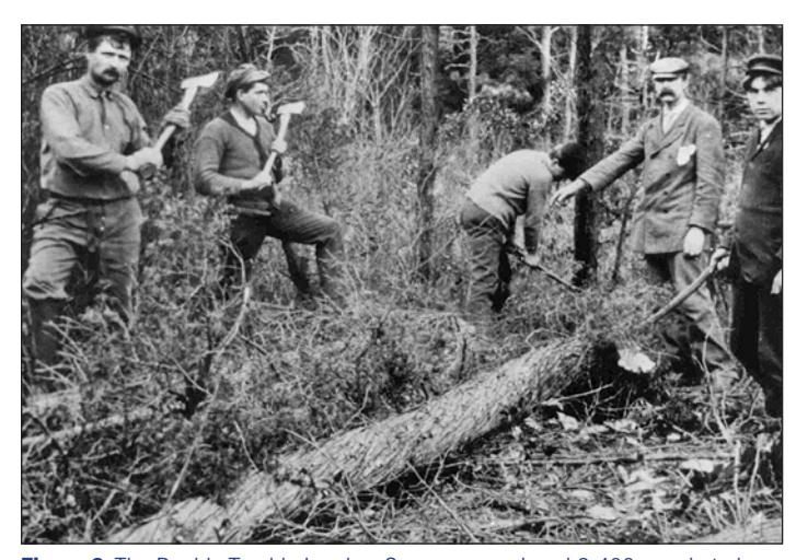
Figure 3. The Double Trouble Lumber Company employed 2,400 people to harvest, mill, transport, and sell lumber in the mid-1800s. (Courtesy New Jersey Department of Environmental Protection, Double Trouble Village State Historic Site archives, circa 1910)

Atlantic white cedar is native to the Atlantic and Gulf Coasts of North America and is found from Southern Maine to Mississippi. Locally known as Jersey cedar, the trees grow in forested wetlands where they dominate the canopy. It takes about 70 years for a cedar to grow to a harvestable size. The hardy wood is resistant to decay and warping. It was often milled as roof shingles and clapboard siding (figure 4). Local shipbuilders used this prized wood for constructing the Barnegat Bay Sneakbox, a melon-seed shaped boat with a shallow draft that was often used for duck hunting (figure 5).