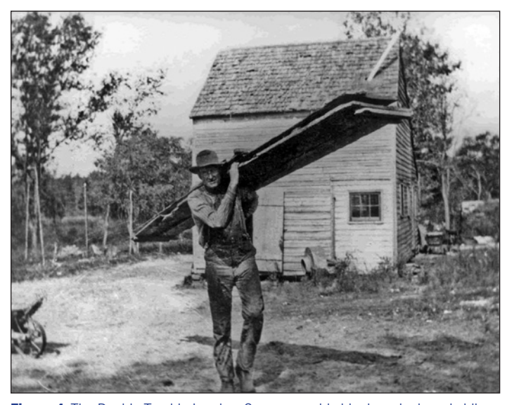
Figure 4. The Double Trouble Lumber Company sold shingles, clapboard siding, posts, rails, channel markers, and bean poles. (circa 1910)