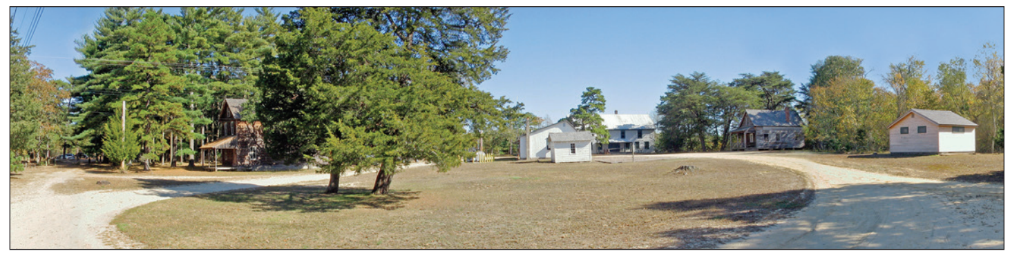
Figure 2. The former company town of Double Trouble has several preserved original buildings including workers' cottages, the general store, the cranberry packing house, and a sawmill. (Courtesy New Jersey Department of Environmental Protection, Double Trouble Village State Historic Site archives, 2005)

property by 1806. His son, Sea Captain George Giberson, inherited the tract in the early 1850s. During the heyday of the lumber industry in the Giberson era, Double Trouble had two sawmills and reportedly employed more than 2,400 people (figure 3). From the seaport in nearby Toms River, lumber was shipped to ports up and down the East Coast.