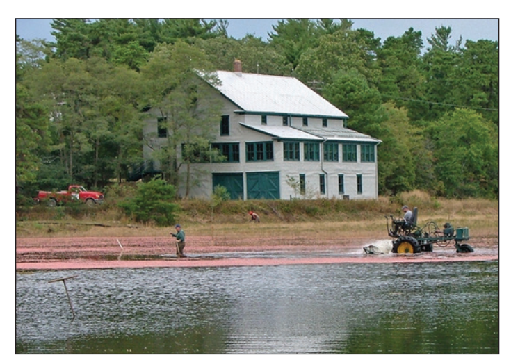
Figure 11. One of the last modern "wet" cranberry harvests at Double Trouble Village.