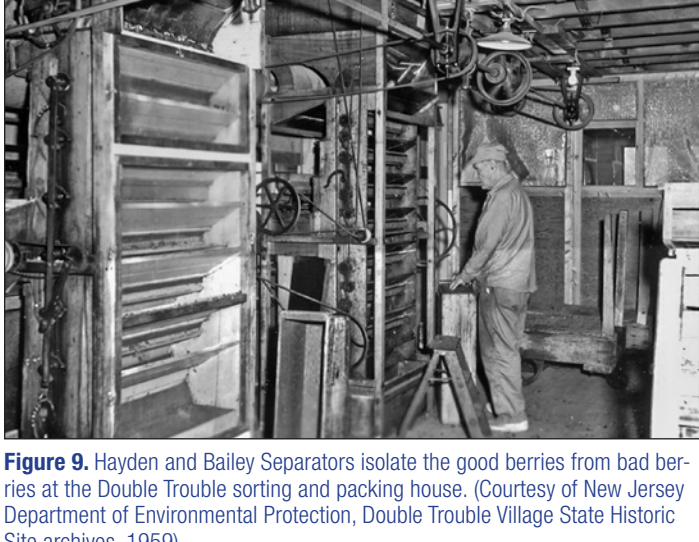
ries at the Double Trouble sorting and packing house.

For almost a century, cranberries were "dry" harvested at Double Trouble. Berries were originally picked by hand one at a time. As the industry expanded, migrant workers raked berries off the vine with a cranberry scoop—a wooden box with metal tines (figure 8). The fresh cranberries were then sorted and packaged on site for shipment to market (figures 9 and 10). Starting in the mid-1960s the Double Trouble cranberry bogs were "wet" harvested. Bogs were flooded with water from the reservoir. A machine was then used to knock the buoyant berries off the submerged vines. These floating cranberries were corralled to one side of the bog and removed for shipment to a central receiving plant in Chatsworth, NJ (figure 11). As the cranberry industry